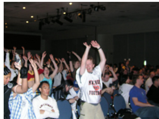
"The Wave" at Closing Ceremony

A sad day for some, a new horizon for others, but however you felt about it, you were more than welcome