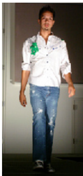
Illustration Destroyed Denim with Vintage Button-Up Shirts

mens denim in a light blue tint these pants can match back to any tee or button up top. Women were shown great light weight skirts to help beat the summer heat as well as tanks in various silhouettes.