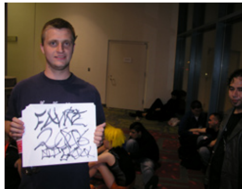
Getting some fresh air, outside the Techno Dance Room

Pure and hilarious as it should be. I'm talking beautifully absurd fan parodies made just the way we want them. Now here is where I must admit that I actually left before seeing too many due to the amazing ability of wall-to-wall bodies generating a disgusting amount of heat. Combine this heat with one room, lots of sweat and some fans' apparent phobia of soap and you have a lovely experience. After being there for fifteen minutes I was having strange thoughts of running around without a chicken and spraying milk with a hose. It was then that I decided maybe a couple hours of sleep wouldn't be such a bad idea.