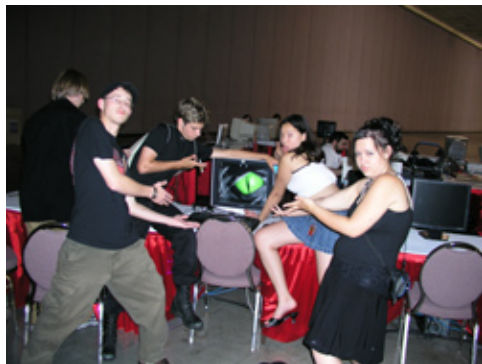
Locals displaying the advanced PC-Gaming machines

After you have had your fill of panels, video programming, and shopping in the merchandise room, you can go and