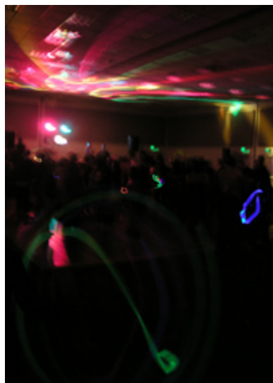
Late Night Techno Dance Room

But all hours video programming wasn't the only thing keeping heart rates up. Every night the dance floors filled as DJs from around the area started to spin J Pop, house and trance. Giving the fans just one more reason to get down and move. Now, I know what you're thinking. That's Amazing! And you're right, I mean, who wouldn't like scantily clad men and women moving with the rhythmic beats of the music, well as the saying goes, soap is you friend!