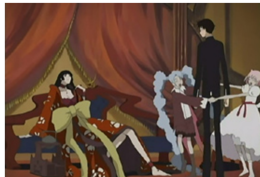
Yuuko (left) and Watanuki (right)

Watanuki Kimihiro has had a difficult time over the past few years, as his parents died in a horrible accident, and he has had to take care of himself. Watanuki has problems other than dealing with the everyday trials of normal life. He is plagued with the rare gift of being able to see evil spirits, not only does that make things more difficult than normal, but the evil spirits are also attracted to Watanuki.