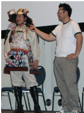
Guy with anime armor

I wasn't quite sure what to expect from FanimeCon 2006, as this was going to be my first con in over 12 years, but that didn't slow me down on the drive to San Jose. When I arrived on Friday I was immediately inundated with costumed figures I could not identify and a collection of new terms which I would only start to understand and use by the end of the event. But the attitudes of fans were great as they helped me stumble through the native language of Anime. Equally amazing were the costumes, many of which I'm sure took quite some time to both make and don every-day.