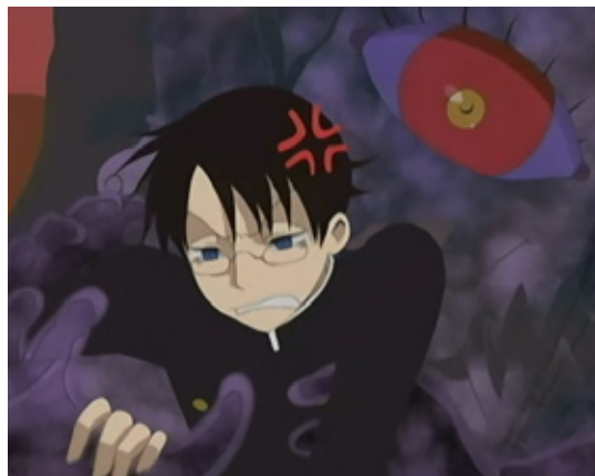
Watanuki and evil spirits

One day walking home from school, a large amount of evil spirits gather around Watanuki, and force him to the ground, the only thing that saves him, is by touching the fence of a large local house. After touching the fence, all the evil spirits magically disappear. Curious as to why the spirits disappeared when he touched the fence, Watanuki takes a quick look at the house, and is suddenly unable to control his legs.