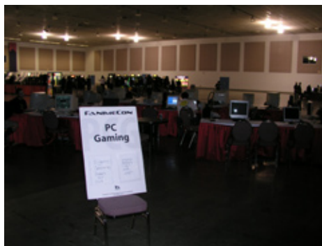
PC-Gaming: Tournaments, New Releases, Free Play

With every game console ever created, you can play games all the way from classic to just off the shelves new, games like, Megaman, Castlevania 1-3, Final Fantasy 1-12, Tekken 1-5, Capcom vs SNK 1 & 2, and many more.